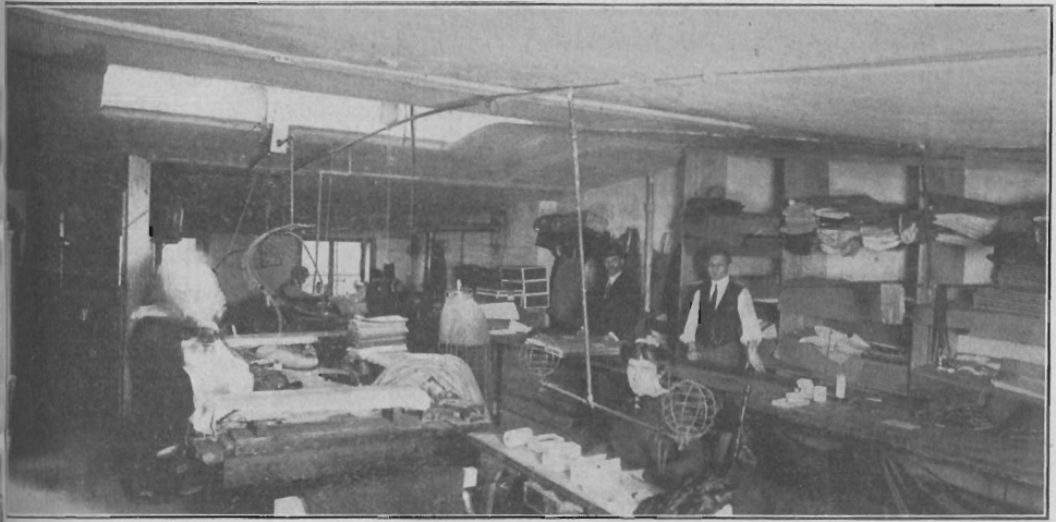
A Garret Shop